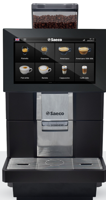
SAECO SE 120