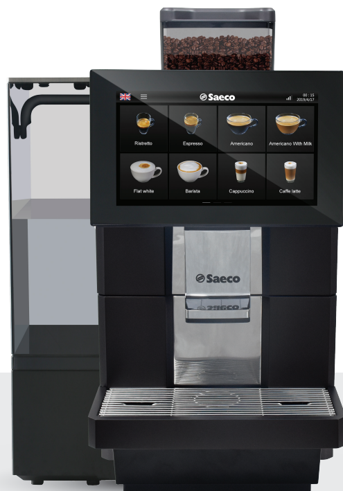
SAECO SE 180